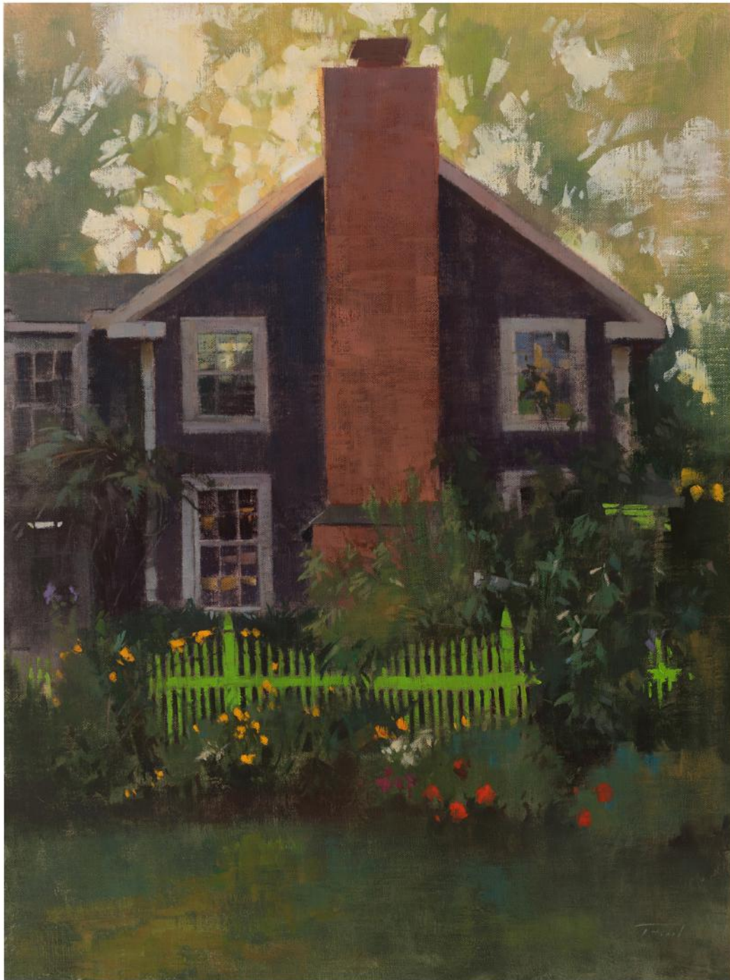
Dusk in Saint Michaels